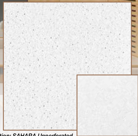
Option: SAHARA Unperforated